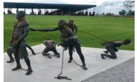
National Memorial for Peace & Justice Legacy Museum

The Racial Justice Pilgrimage is just around the corner. Twenty-two Emmanuel pilgrims will depart for Atlanta on February 17. At a recent gathering, pilgrims shared some of what they were looking forward to and what they were fearful of. The word clouds below are the result: