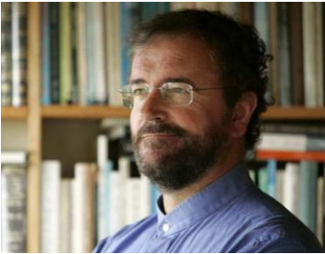
John O'Donohue 1956-2008

November begins with the celebrations of All Saints and All Souls. We do not always attend to these festivals as carefully as our more liturgical siblings, but they still resonate. These celebrations recognize the powerful spiritual bond between the living and the departed. We may refer to this as the communion of the saints or employ the image of the great cloud of witnesses from Hebrews 12. Those who came before us shaped us by the decisions they made, the doctrine they taught, and the institutions they left behind.