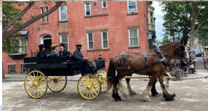
Dove & State streets with 1880's activities