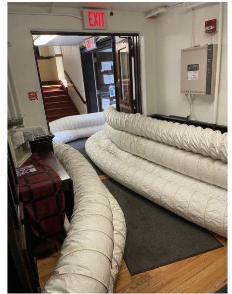
Portable air conditioning, to keep the extras comfortable in-between takes