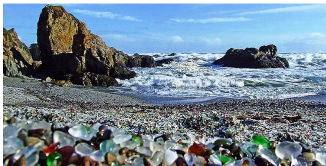
Glass Beach Fort Bragg, CA