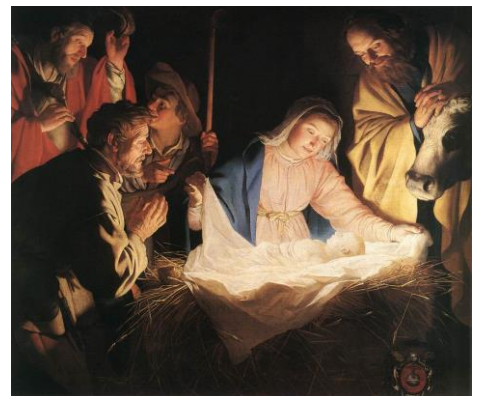
“Adoration of the Shepherds” Gerard van Honthorst, 1622