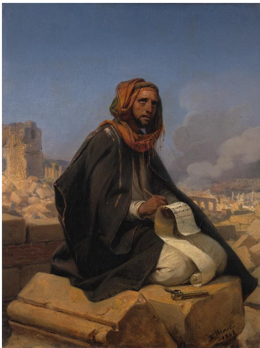
Jeremiah on the ruins of Jerusalem Horace Vernet (1844)