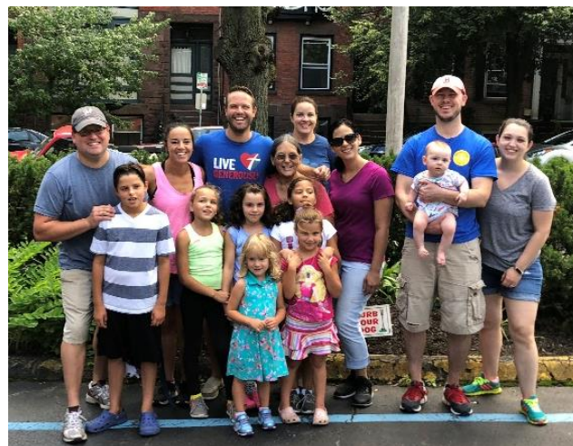
members of Renew Church, a small “church planter” in Colonie